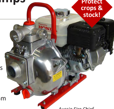
Aussie Fire Chief

Property protection | Spot fires High pressure water transfer | Spray irrigation Dust suppression | Harvest protection